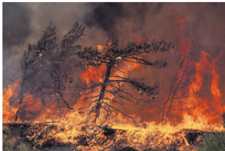
Flames burn a forest in Vati village, on the Aegean Sea island of Rhodes, southeastern Greece on July 25, 2023.

2000. The government has pointed to a changing climate and extreme weather that has included drier winters